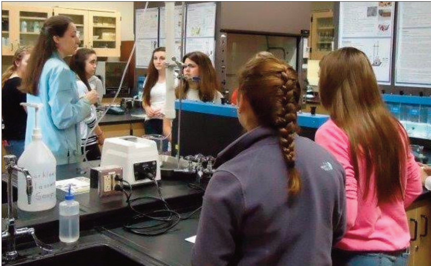
Women in Engineering Day at SUNY Canton promoted STEM – science, technology, engineering and math.