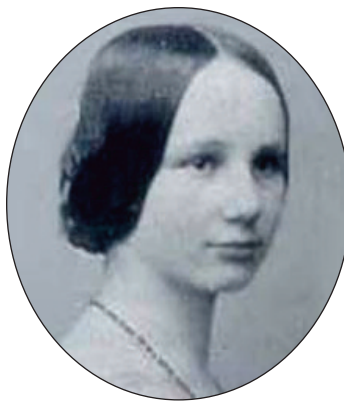
Ada Lovelace, the first computer programmer.