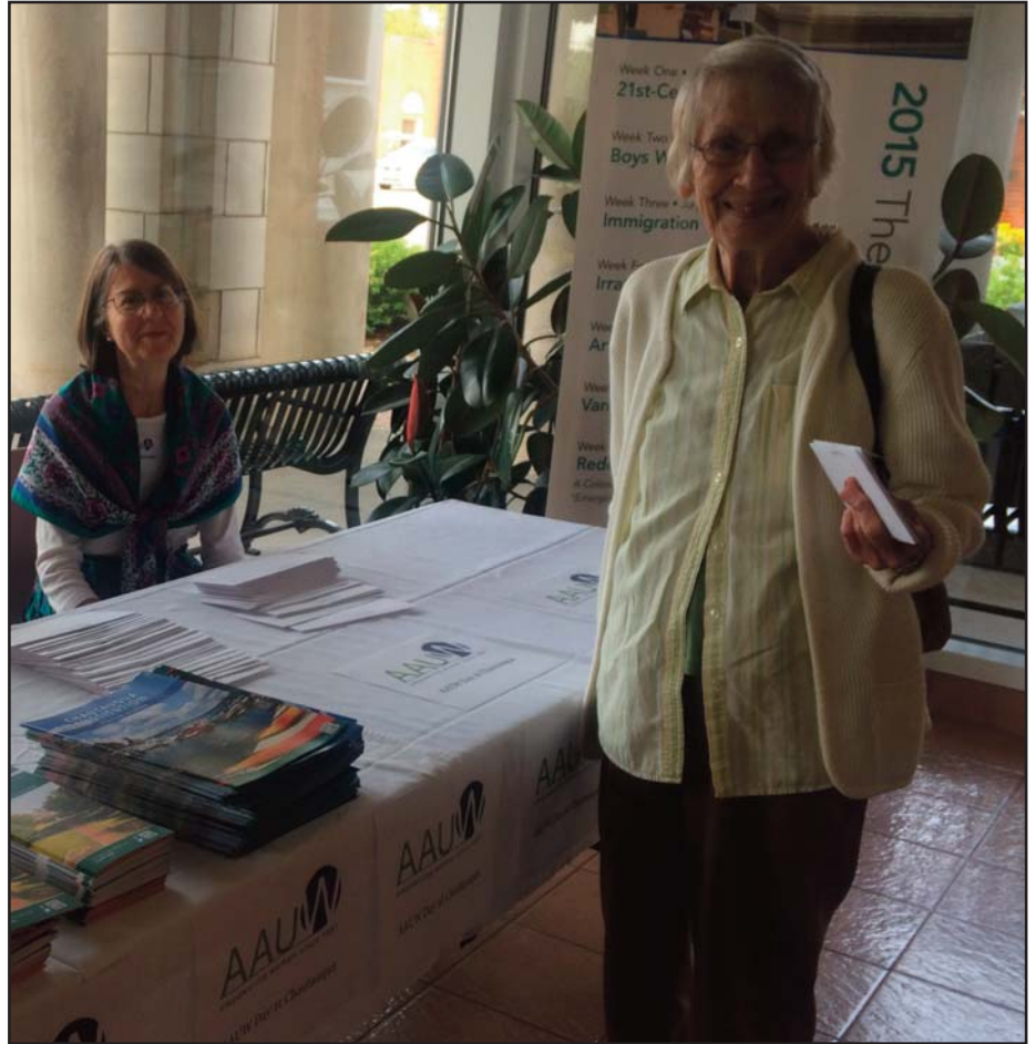
Members of the Jamestown Branch welcomed guests to Chautauqua.