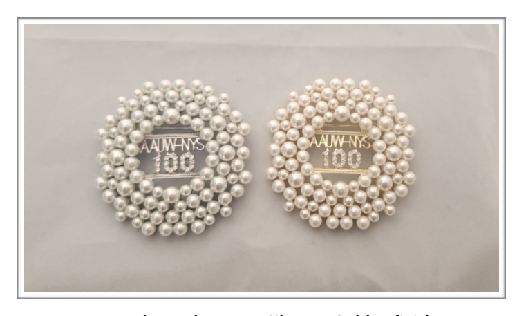
You can choose between Silver or Golden finish

You can purchase online via PayPal (link below), or send a check payable to AAUW-NYS, to Janice Brown - 27708 Rogers Rd, Evans Mills-NY, 13637.