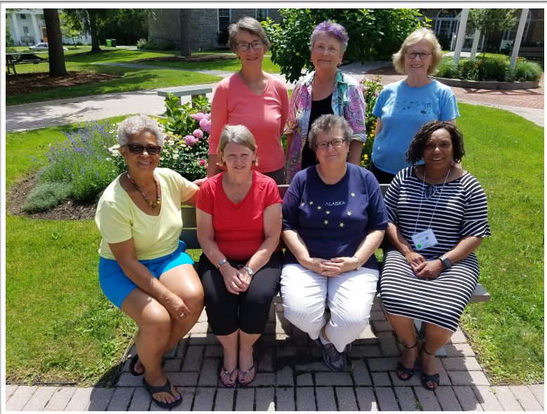
Photo of 2019-2020 AAUW-NYS Executive Board during the 2019 Summer Leadership Conference, at Cazenovia College.