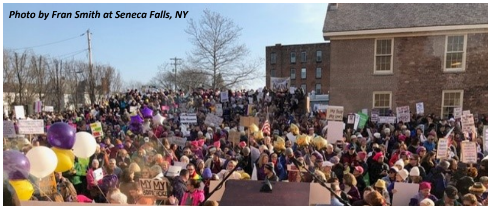
at Seneca Falls, NY