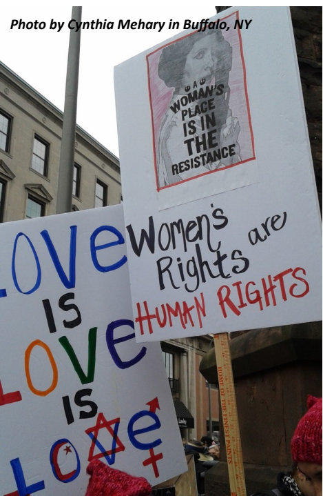
in Buffalo, NY