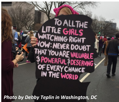
in Washington, DC