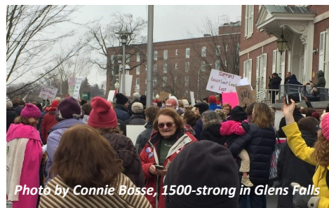
1500-strong in Glens Falls