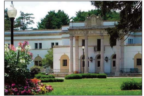
The Lincoln Baths building.

You can even purchase a special "Ladies Bonnet" for the polo games or the