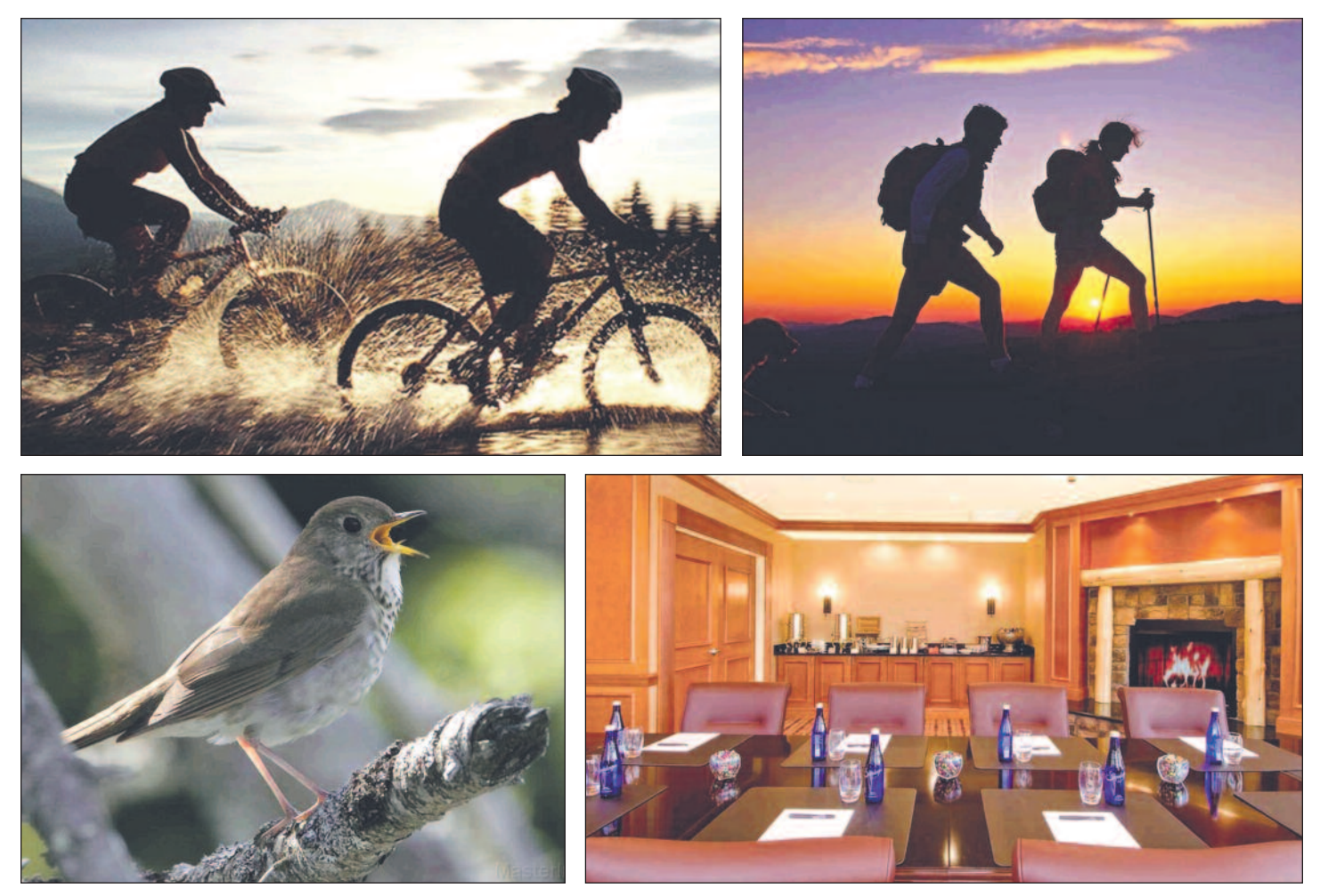
Overlooking Mirror Lake, High Peaks blends Olympic history with Adirondack charm. It's the perfect place to welcome spring.