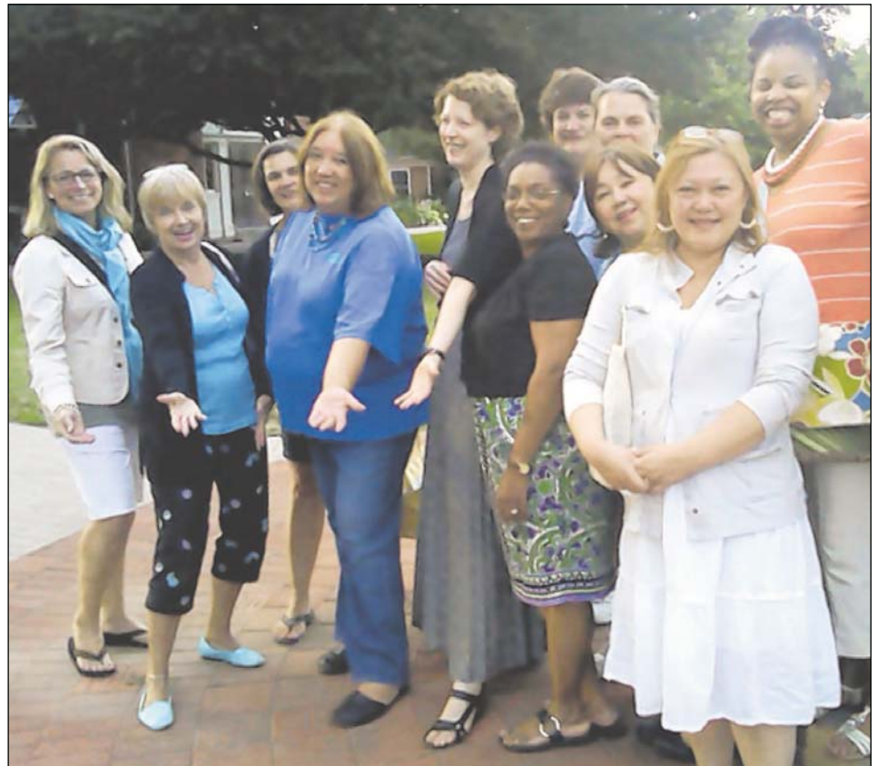
WHAT HAPPENS IN CAZ STAYS IN CAZ: A night out after a day of leadership training kicks off with a photo opportunity on the bucolic Cazenovia campus.

We got off to a great start as 75 AAUW members from across the state met on the beautiful campus at Cazenovia College from July 20 to 22 for the Summer Leadership Conference. They had the chance to meet members of other branches and to exchange ideas.